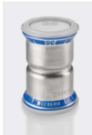
↑ For industrial gases, the Geberit Mapress pressing system can be used in all dimensions from 15 to 108 mm

Geberit Mapress Stainless Steel and Mapress Copper can also be used for a variety of inert industrial gases using the black standard seal ring according to the TÜV component certificate. Everything from shielding gases for welding applications through to packaging gases for the food industry is possible with the systems. Geberit Mapress Stainless Steel can even be used for various active gases such as oxygen and hydrogen.