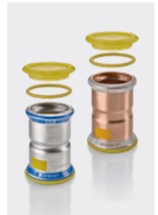
↑ Geberit fittings for gas applications feature a yellow seal ring and a yellow cap.