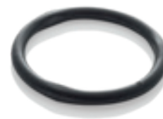
↑ CIIR seal ring for secure sealing in general industrial applications.